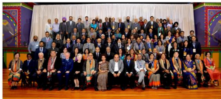
CONFERENCE & 93 rd AGM 2019 Hosted By Wellington Indian Association